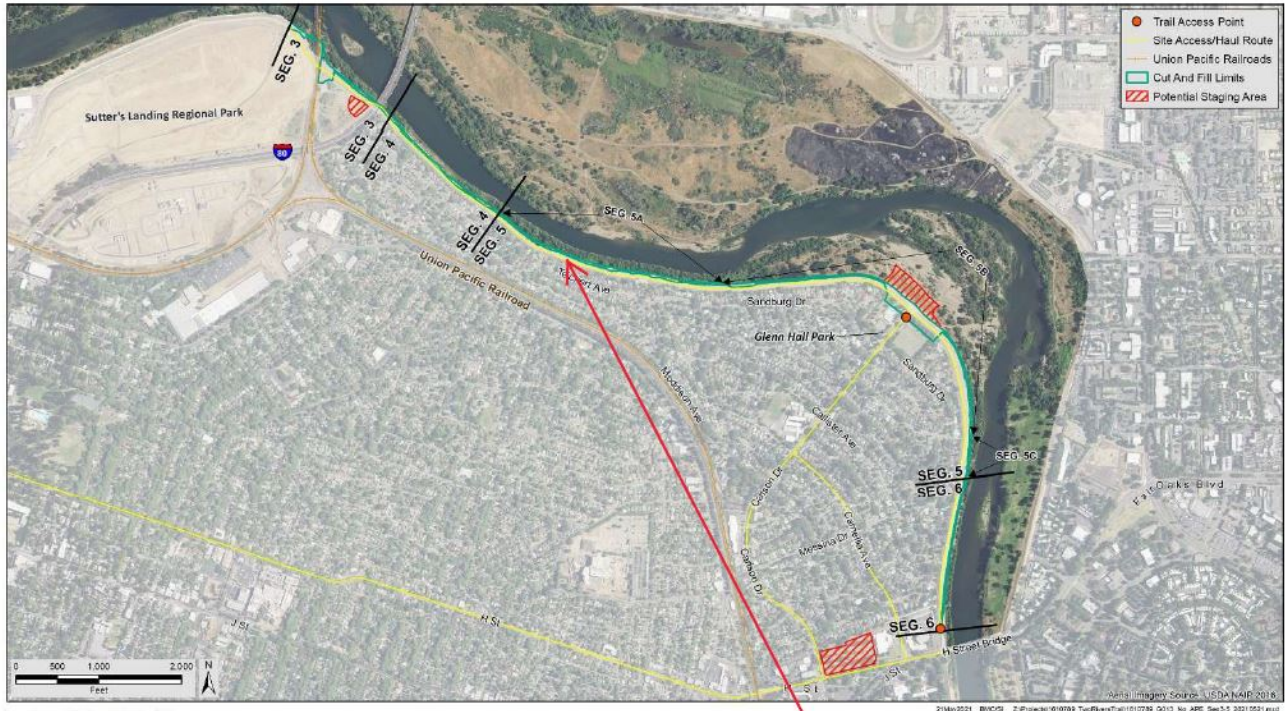
2) Proposed project location map